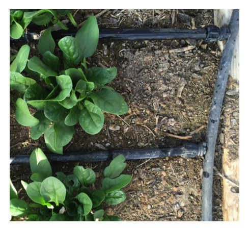
Drip tape has emitters inside the tubing and is connected to a polyethylene line. It is used for vegetable gardens or annual flower beds.

Drip irrigation saves water because little is lost to runoff or evaporation. This watering method, if implemented correctly, promotes healthy plant growth, controls weed growth, and reduces pest problems.