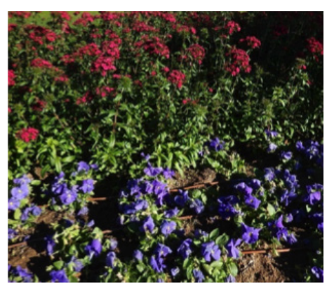
Laser lines are a type of micro-tubing with emitters embedded inside the tube.