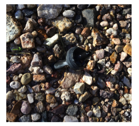
This drip emitter is connected to micro-tubing which is attached underground to a lateral line..

Drip irrigation – also known as low-flow, micro, and trickle irrigation – is the slow, measured application of water through devices called emitters. It is the most efficient way to irrigate. A wide variety of quality products has been developed to make drip irrigation reliable and easy to use for almost any landscape situation.