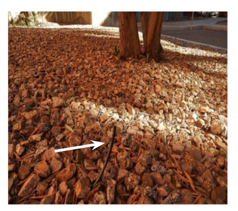
This micro-tube delivers water to the root zone of the tree. Under ground, it is attached to an emitter connected to a polyethylene tube.