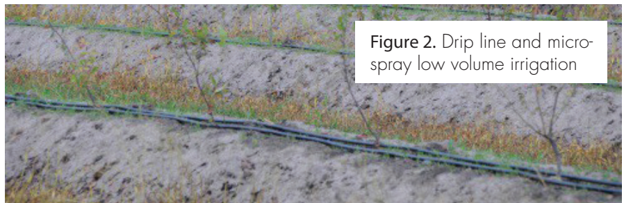
Table 7. Plugging potential of irrigation water in micro- or drip irrigation systems.