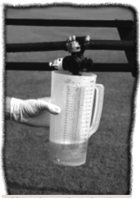
Measure the output from each nozzle for 1 minute.