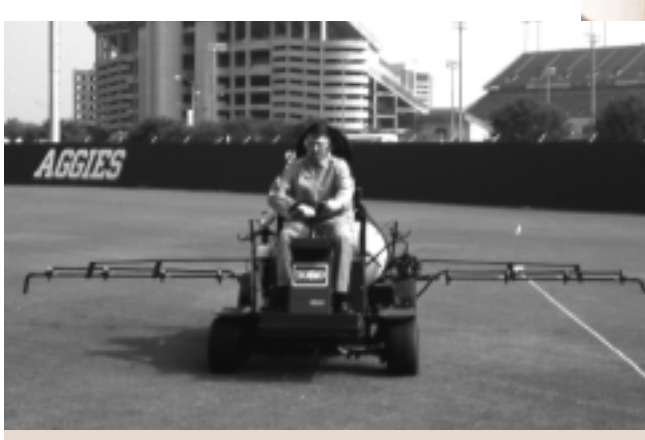
Drive the 200-foot distance with the tank half full, and at desired RPM and gear settings.

Use the same information from the GPA example, except substitute 20 GPA for the 36.66 GPA calculated for the sprayer.