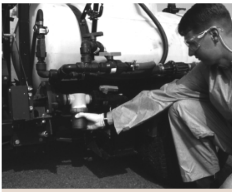
Check and clean filters on the sprayer before use.