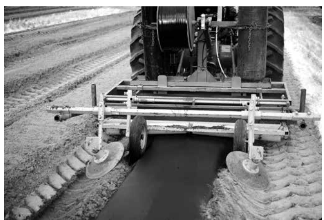
Laying plastic mulch and drip tape

*Only plastic mulch and drip irrigation components are included. The field is assumed to be level with an adjacent surface water supply (pond). The filters designed in this system are capable of irrigating one acre at one time. The system contains media filters, a venturi injector, and a 5.5-hp engine and pump. Additional equipment to consider includes water meters. Although the base equipment used in this example will sufficiently handle more than one acre, carefully consider the number of zones and the time required to irrigate additional zones before purchasing equipment. No sales tax, freight, or field labor was included in these estimates.