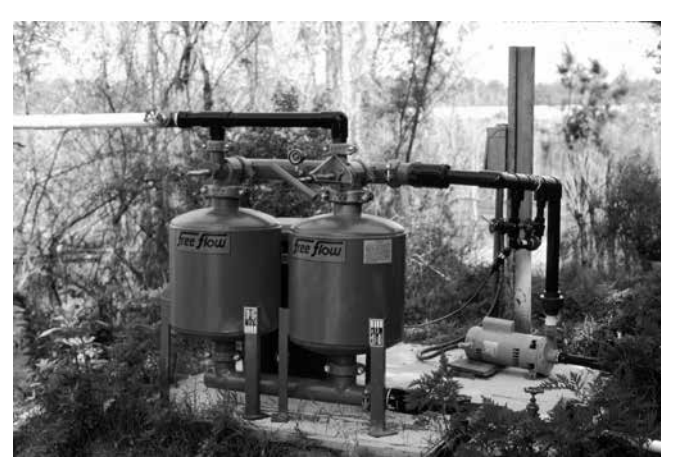
Sand filter, pump, and fertigation unit

Media filters are the most common filters used in commercial vegetable production. Ranging from 14 to 48 inches in diameter, they are usually installed in pairs. Media filters are expensive, heavy, and large, but they can clean poor-quality water at high flow rates. In a media filter, 12 to 16 inches of media (sand or crushed rock) act as a threedimensional filtering agent, trapping particles within the top inch or two of media. As the media fills with particulate matter, the pressure drop across the media tank increases, forcing water through smaller and fewer channels. This will eventually disable a media filter, requiring that clean water from one tank be routed backwards through the dirty tank to clean the media. This "backwashing" requires exact flow rates to make the media "dance" and be thoroughly cleaned. Large, commercial-sized filters require electronic controls and hydraulic valves to route the water. Typically, the pressure drop across a clean media tank is 2 to 3 psi. When the pressure differential across the media filters reaches a given level, typically 5 to 8 psi higher than when the tanks are clean, it is time to blackflush the filters.