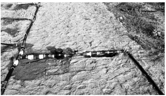
Irrigation mainline with screen filter, pressure regulator, pressure gauge, and water meter connected to submain

Mainline distribution to field: Underground polyvinyl chloride (PVC) pipe or above-ground aluminum pipe is used to deliver water from its source (pump, filtration system, etc.) to the sub-mainline (header line).