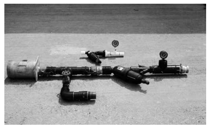
Screen filters, pressure regulators, and pressure gauges

Watering several fields or sections of fields from one water source can be accomplished by using automatic or manually operated valves to open and close various zones. Either hand-operated valves (gate or ball type) or automated electric solenoid valves (using a time clock, water need sensor, or automatic computer controller box) can be used to control irrigation zones. It is also recommended that a