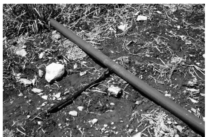
Vinyl lay flat hose with connector and drip tape

Sub-mainline (header): It is common to use vinyl "lay flat" hose (polyethylene pipe) as the sub-mainline (header line). This hose is durable and long lasting, and it lies flat when not in use so that equipment can be driven over it. The lay flat hose, connectors, and feeder tubes are retrieved after each growing season and stored until the following year. Since polyethylene pipe is somewhat rigid, it is not easily rolled up at the end of the season.