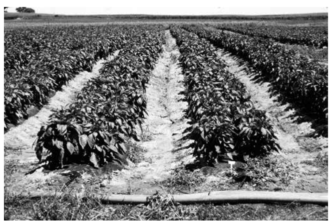
Drip irrigation of bell peppers

This publication was developed by the Small-scale and Part-time Farming Project at Penn State with support from the U.S. Department of Agriculture-Extension Service.