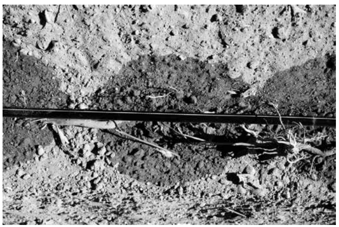
Drip tape and wetting pattern

Connectors/couplings: Plastic connectors or couplings are used to connect the drip line to the sub-main.