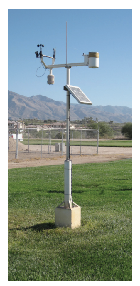
Figure 1. An automated weather station commonly used to estimate turf ET.

The weather station provides the weather data necessary for computation of \text{ET}_{0} . The four weather variables used in this computation are: 1) solar radiation, 2) wind speed, 3) temperature, and 4) humidity. It is important for owners of