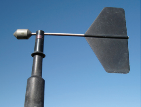
Figure 4. Wind speed is usually measured with a cup anemometer (above) while a wind vane (below) is used to monitor wind direction.

pyranometer is typically located underneath a sealed glass dome.