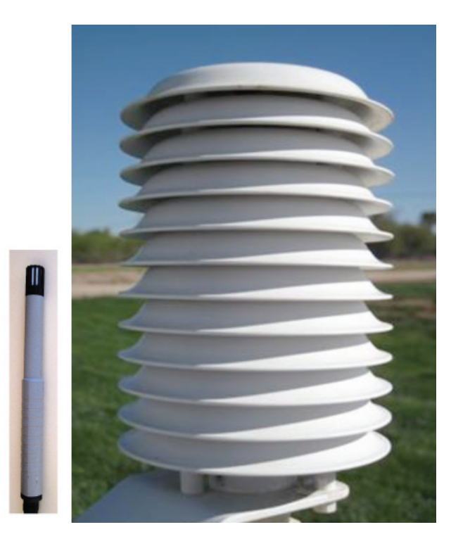
Figure 3. A combination temperature and relative humidity sensor (left) is housed within this radiation shield to protect the sensor from direct exposure to sunlight and rainfall.