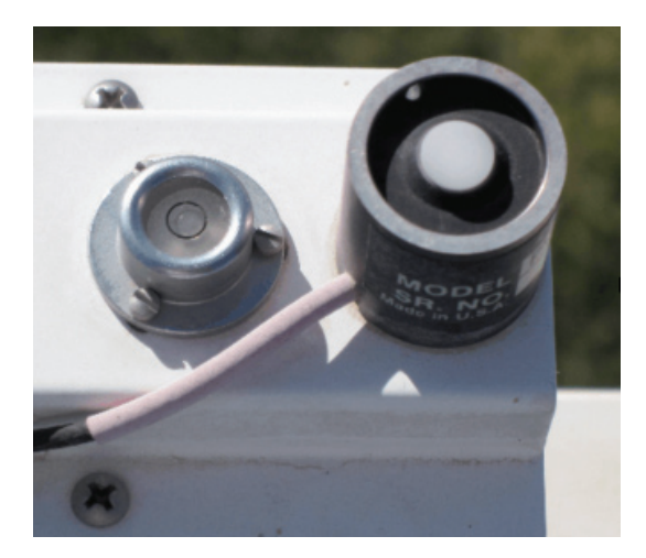
Figure 2. The silicon cell pyranometer is used to measure solar radiation on many automated weather stations.

A weather station, like any other piece of equipment, requires regular maintenance if it is to perform its assigned task correctly. Some of the more important maintenance chores can and should be performed by local grounds maintenance personnel since they have access to the station on a regular basis. Other maintenance work should be performed by a trained weather station technician. However, before describing the required maintenance chores and who should perform them, a brief physical description of the sensors commonly found on a weather station is in order.