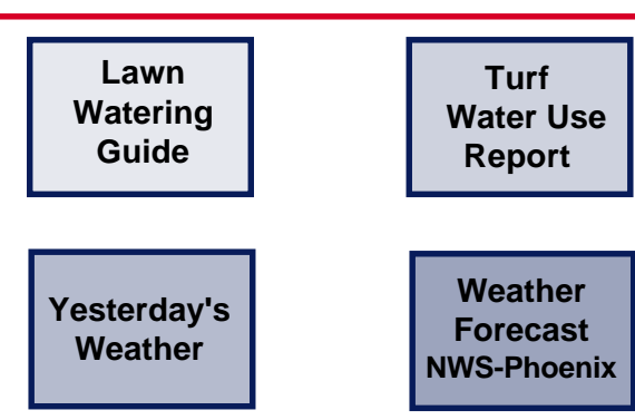
Fig. 3. The Phoenix Area Turf Water Management Web Page. Click on the appropriate box to access Lawn Watering Guides or Phoenix Area Turf Water Use Reports.