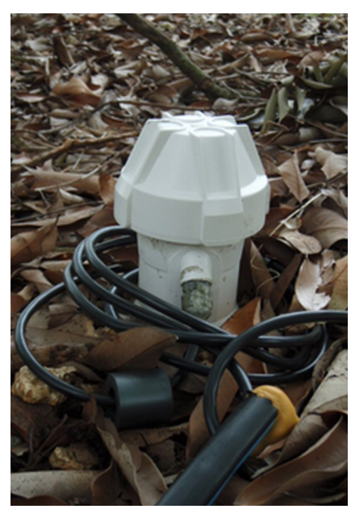
Figure 5. Multi-sensor capacitance probe installed in a south Florida grove.