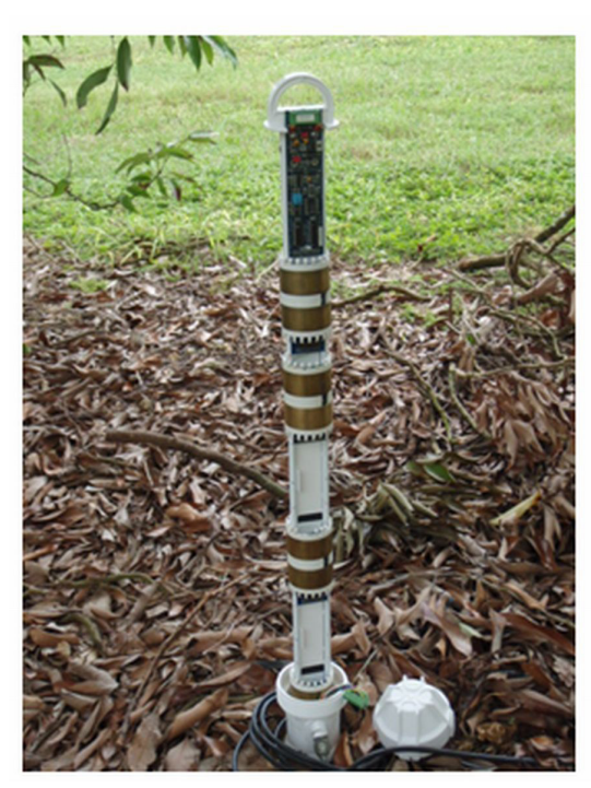
Figure 4. Multi-sensor capacitance probe being inserted into field.

The probes provide real-time assessment of soil water content. Thus, the data from a probe will only give information and characteristics about the area where it is installed. Data from one orchard should not necessarily be used to manage other orchards because soil and water characteristics may be substantially different among sites.