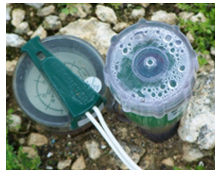
Figure 3. Tensiometer installed in very gravelly loam soil.