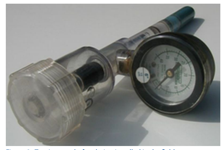
Figure 2. Tensiometer before being installed in the field.

This device directly measures soil water potential or tension in the root zone (Figure 2). Tensiometers must be properly installed and maintained to be used effectively for scheduling irrigation (Figure 3). Tensiometers measure soil water tension in pressure units such as cbars (1 cbar = 0.01 bar; 1 bar = 14.5 psi).