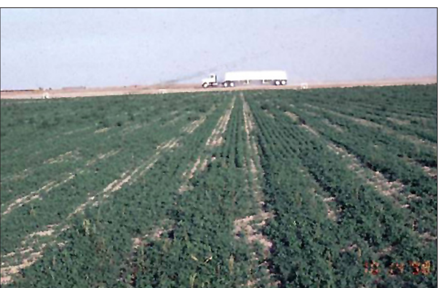
Figures 3a and 3b. The top picture shows alfalfa germination in a 60-inch spaced dripline plot. The bottom picture shows alfalfa germination in a 40-inch spaced dripline plot.