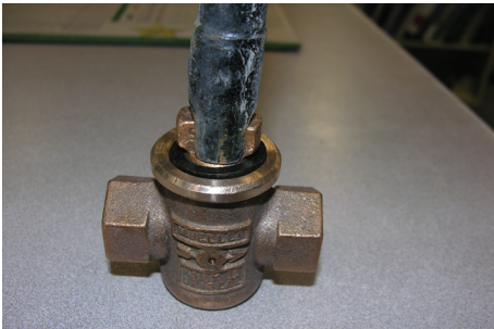
Figure 2: Stop and Waste with a key.