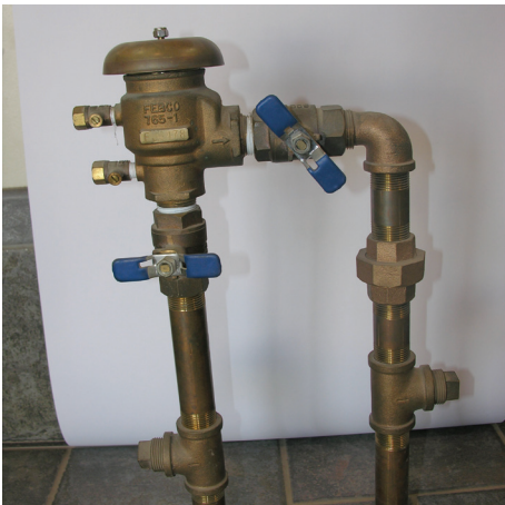
Figure 3a: Left Photo – Pressure vacuum backflow device (PVB).