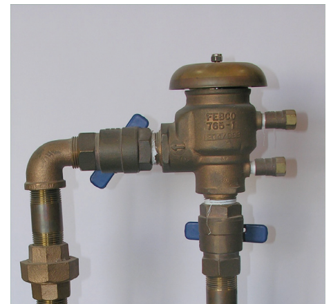
Figure 4: Both ball valves and test cocks should be exercised back and forth several times.

are either fully closed or fully open tend to trap water, expand and cause damage. In the spring, close the test cocks and ball valves before pressurizing the system. Once the water supply to the PVB is turned on open the ball valves slowly to pressurize the rest of the irrigation system. Opening the ball valves slowly will prevent damage to the system which can be caused by water hammer.