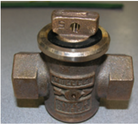
Figure 1: Stop and Waste.

For example, if the system is designed for 30 PSI and 20 gallons per minute per zone, divide 20 by 7.5. The answer is 2.66 cubic feet per minute. A compressor capable of providing 2.66 CFM (Cubic Feet per Minute) at 30 PSI (Pounds per Square Inch) will be required. Under-sized compressors